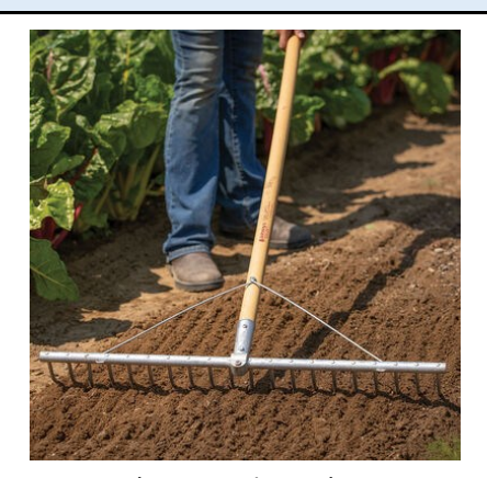
Bed Preparation Rake