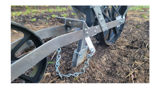
Jang Push Seeder